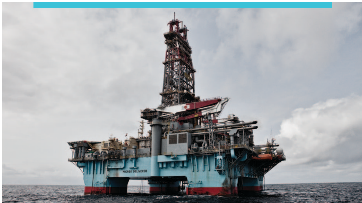
Maersk Drilling Offshore West Africa

Maersk Deliverer is an ultra deepwater semi-submersible capable of operating in water depths up to 10,000 feet. In Q2 2012 it became Maersk Drilling's first rig to operate offshore Angola.