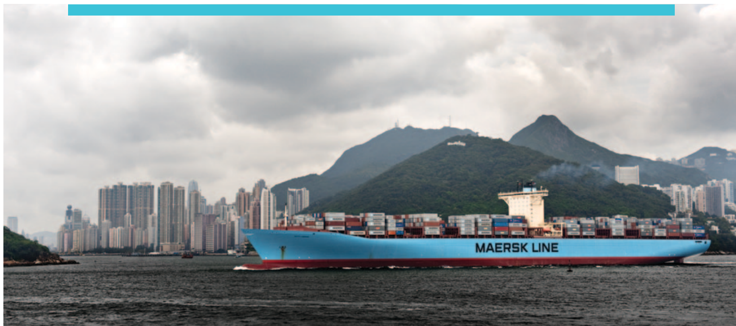
Maersk Line Hong Kong, China

Maersk Line increased the volume on the back haul from Europe to China with 40% during the first six months of 2012 compared to the same period last year.