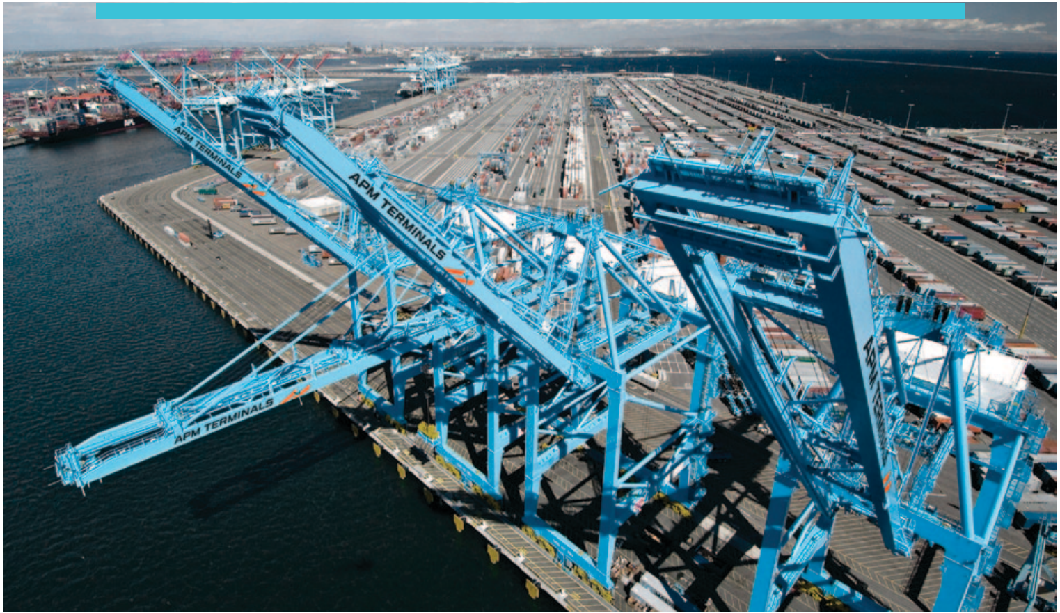
APM Terminals Los Angeles, USA

APM Terminals Pier 400 facility features on-dock rail and the most advanced environmental features.