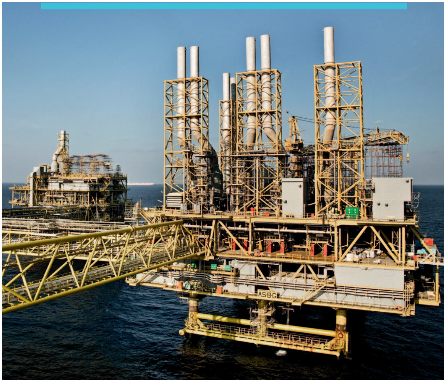
Maersk Oil Al Shaheen field, Qatar

The Al Shaheen field in Qatar produces 300,000 barrels of oil per day. The field was put into production in 1994 and has since produced 1.2bn barrels of oil.