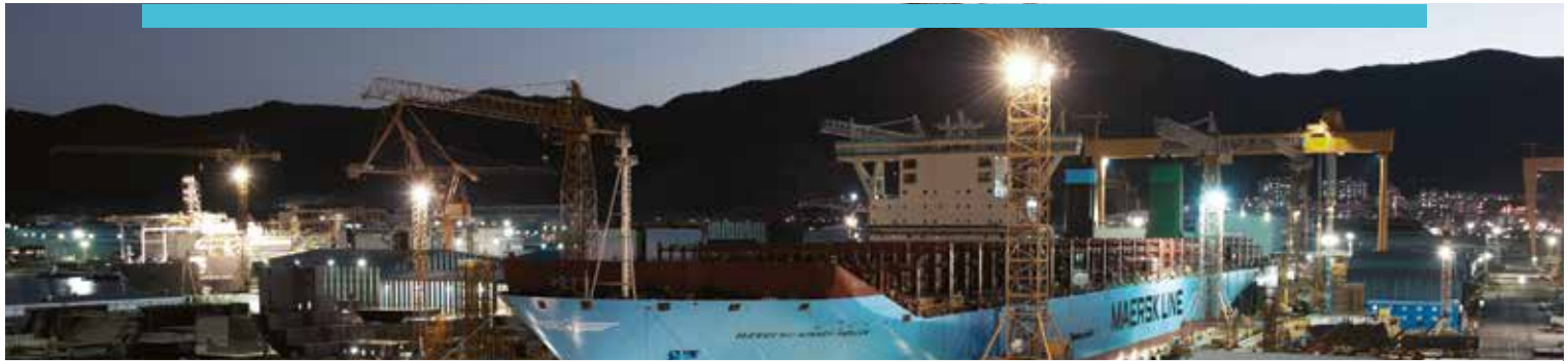
Maersk Line Mærsk Mc-Kinney Møller Okpo, South Korea

At 400 meters in length and weighing 52,859 tonnes – 70 meters longer and five times heavier than the Eiffel Tower – the world's largest ship, Maersk Line's Triple-E vessel, must be built in stages. The entire building process, from the initial steel cutting to the delivery of the vessel, takes 375 days per vessel.