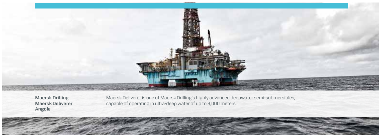
Maersk Drilling Maersk Deliverer Angola

Maersk Deliverer is one of Maersk Drilling's highly advanced deepwater semi-submersibles, capable of operating in ultra-deep water of up to 3,000 meters.