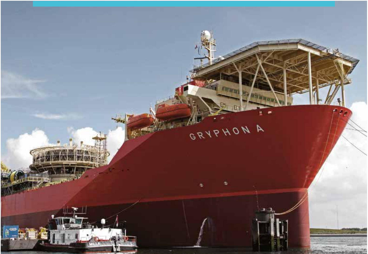
Maersk Oil Gryphon FPSO North Sea, UK

The Gryphon FPSO went back in production in May following a major overhaul of the vessel. Once all the associated fields are fully operational over the coming months, production will ramp up in excess of 20,000 boepd. Production from Gryphon is expected to continue for the next decade.