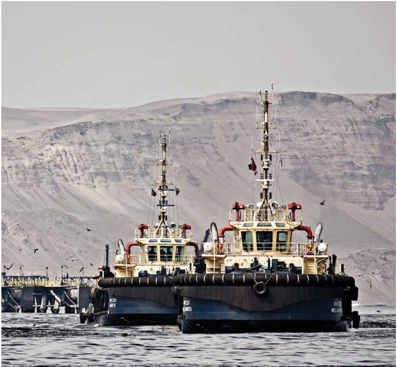
SVITZER Pampa Melchorita Peru

Cash flow from operating activities was USD 405m (USD 338m) and cash flow used for capital expenditure was USD 696m (USD 264m).