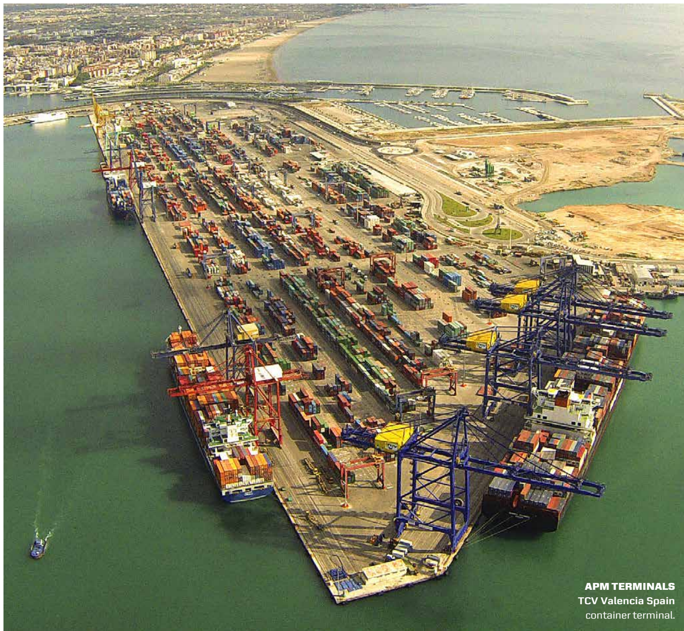
APM TERMINALS TCV Valencia Spain container terminal.

Cash flow from operating activities was USD 198m (USD 271m). Cash flow used for capital expenditure was USD 960m (USD 222m), mainly caused by the acquisition of Grup Maritim TCB. The total enterprise value of Grup Maritim TCB of USD 1.2bn consisted of acquired net assets of USD 0.8bn and acquired net interest-bearing debt of USD 0.4bn.