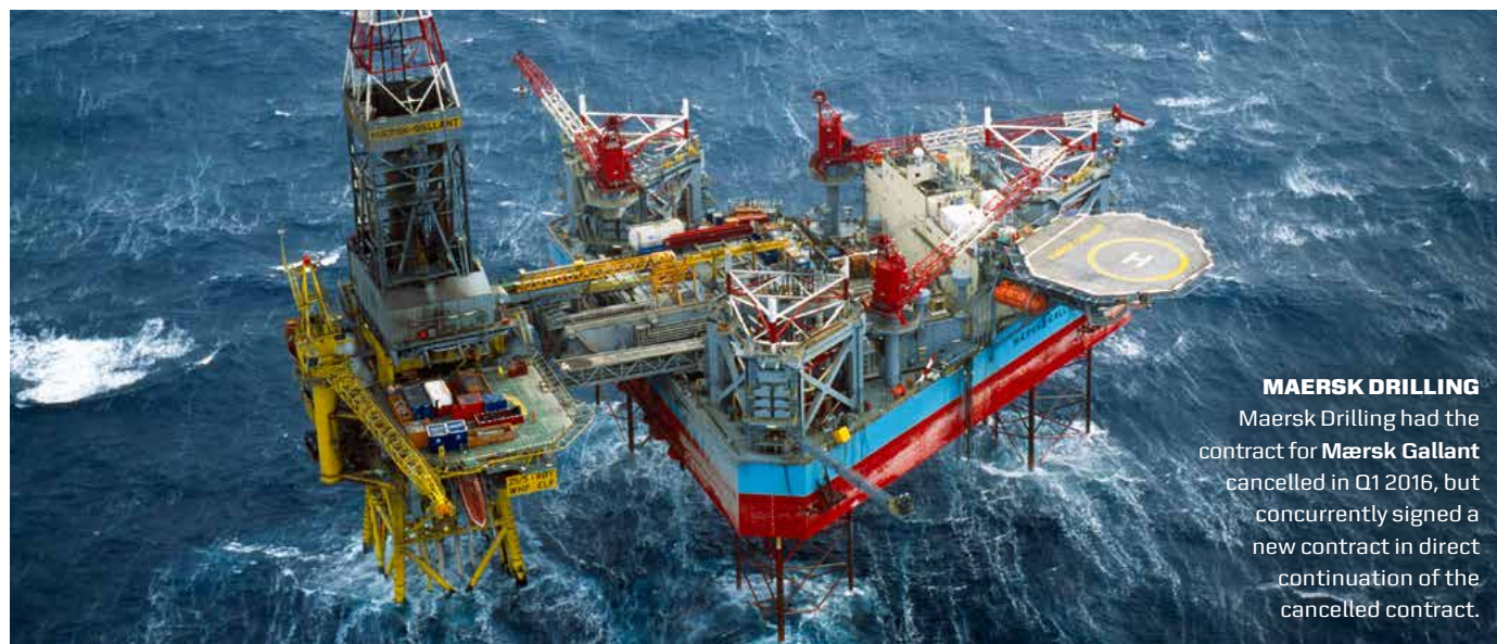
MAERSK DRILLING Maersk Drilling had the contract for Mærsk Gallant cancelled in Q1 2016, but concurrently signed a new contract in direct continuation of the cancelled contract.