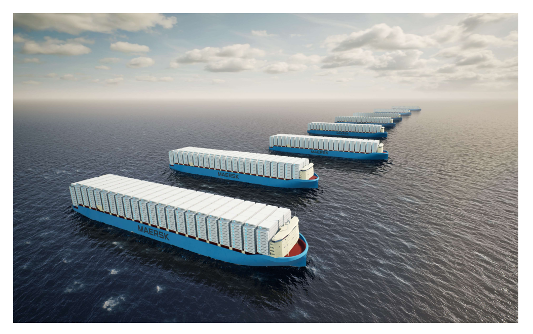
<sup>4</sup> Green is defined as fuels or energy that have 'low' or 'very low' greenhouse gas emissions on a life cycle basis.

The feeder vessel qualifies as green investment in line with our Green Financing Framework and is related to the EU Taxonomy activities 6.10. Sea and coastal freight water transport, vessels for port operations and auxiliary activities.